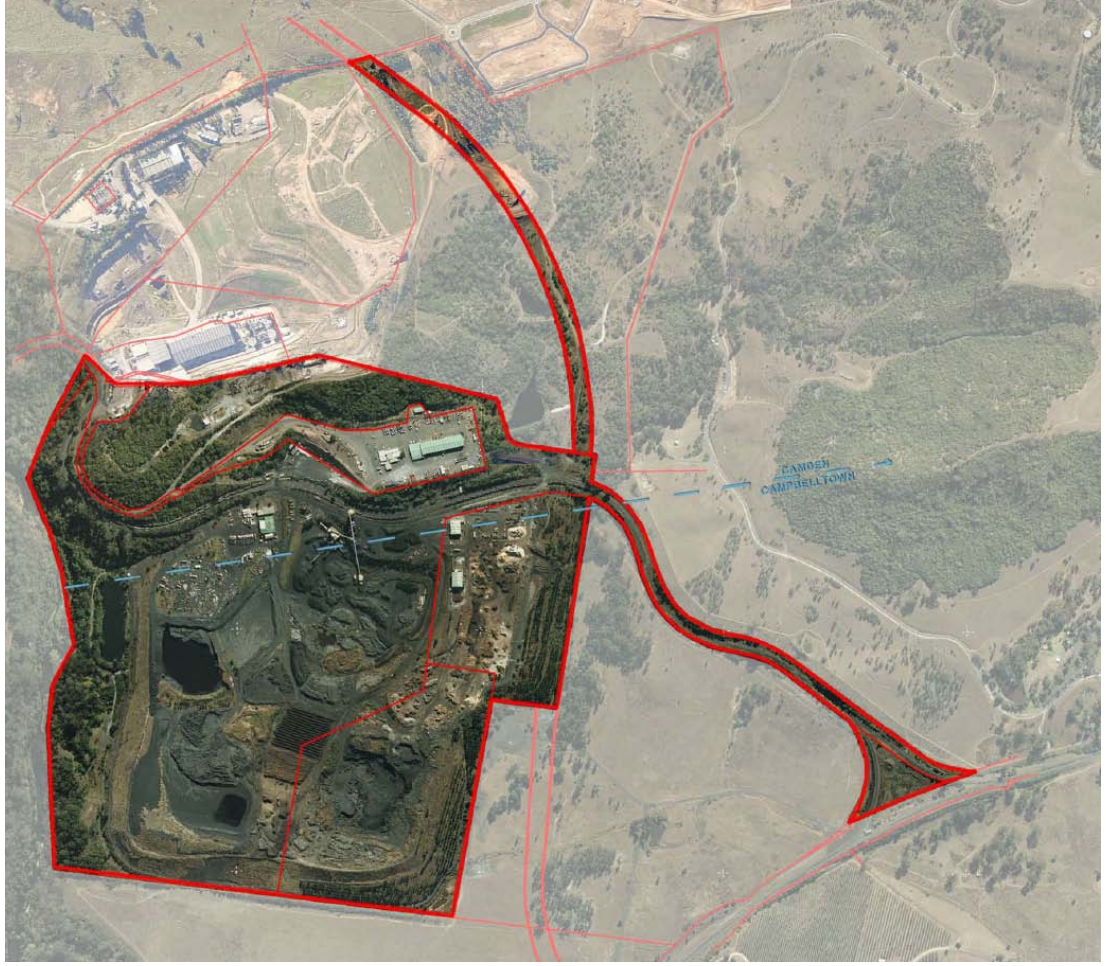
Figure 3 - Subject Site

Based on the previous studies of the LES, an ILP has been prepared over the subject lands. Maps for the site are provided below: