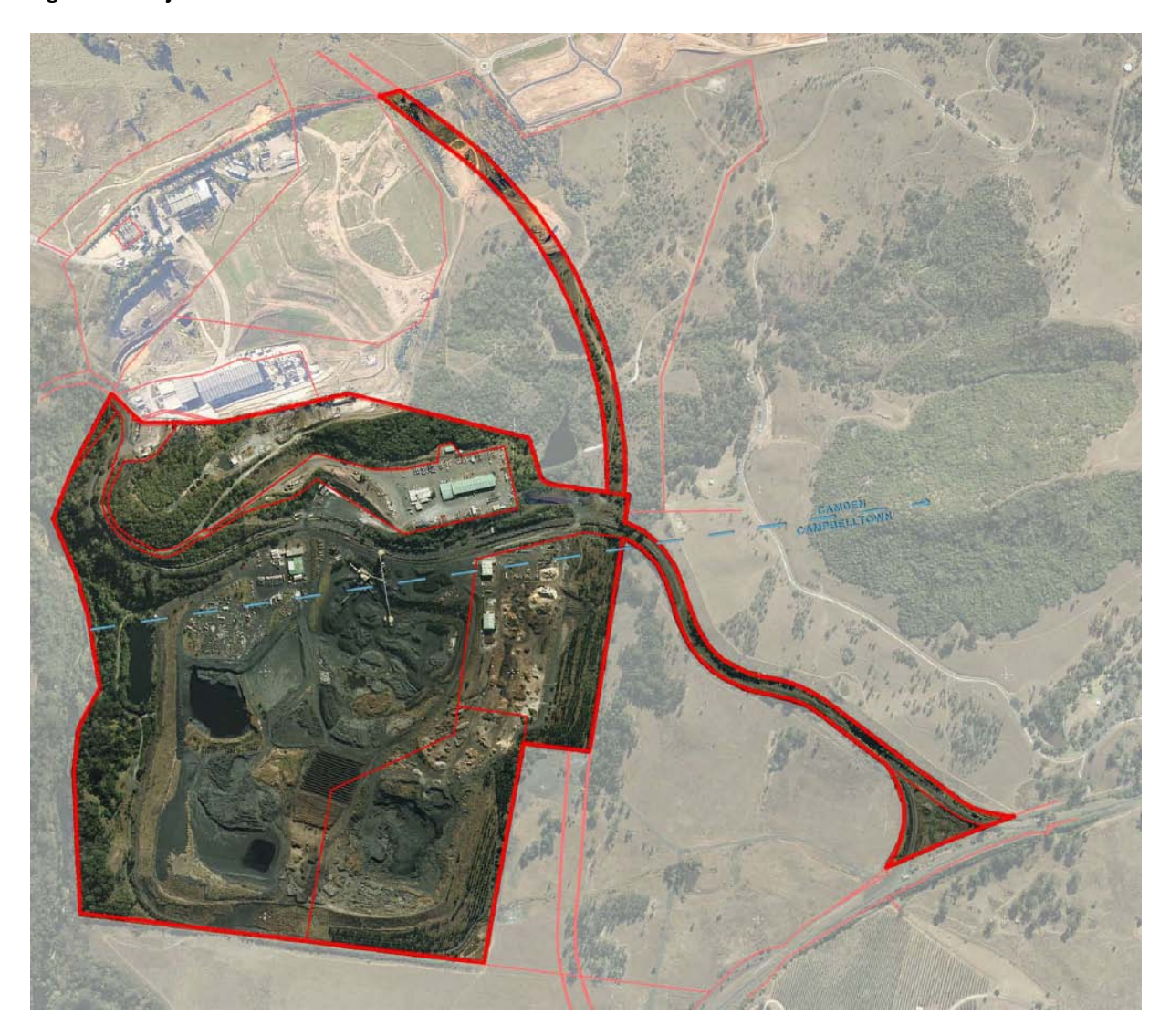
Figure 1 - Subject Site

The subject lands are currently zoned RU1 – Primary Production and SP2 – Infrastructure in the Camden LGA, however, the land has to a greater extent has been used for industrial related purposes for a number of years. These industrial uses include the SADA Services landholding (truck maintenance and depot, coal washery and reject coal emplacement), Camden Soil Mix (truck maintenance and depot, greenwaste and recycling facility), and TRN (truck maintenance and depot). The land subject to the rezoning is depicted in Figure 1 and the site ownership detailed within Table 1 below.